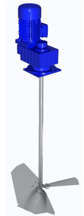
VFR3 flocculator with parallel shaft gear.